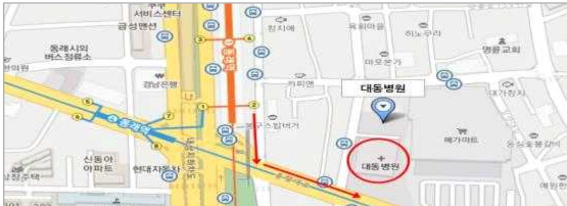
[Map of Daedong Hospital]