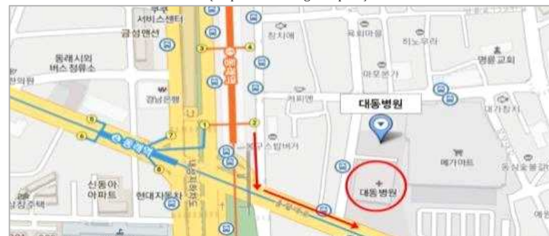
[Map to Daedong Hospital]